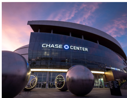
SPORTS Golden State Warriors Event Center & Mixed-Use Development