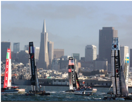
SPORTS 34th America's Cup Race

From small municipal or school playfields to world-class arenas and stadiums, through our work we strive to cultivate beneficial relationships with nearby communities and promote positive engagement with the public. Our work results in projects that are both good neighbors and vibrant additions to the community. ESA brings our multi-disciplinary skills to assignments ranging from focused technical studies to complex environmental review and regulatory compliance. Click on some select projects below to read more on esassoc.com .