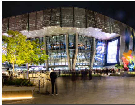
SPORTS Golden 1 Center