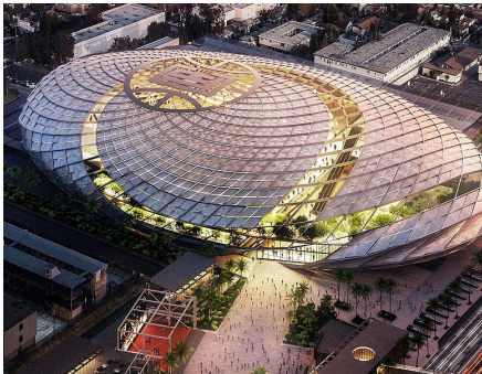
SPORTS & ENTERTAINMENT Intuit Dome