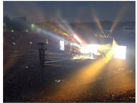
SPORTS & ENTERTAINMENT Rose Bowl | Arroyo Seco Arts & Music Festival