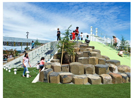
COMMUNITY PARK & SPORTS Thomas Cully Park