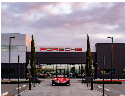
SPORTS Porsche Experience Center Los Angeles