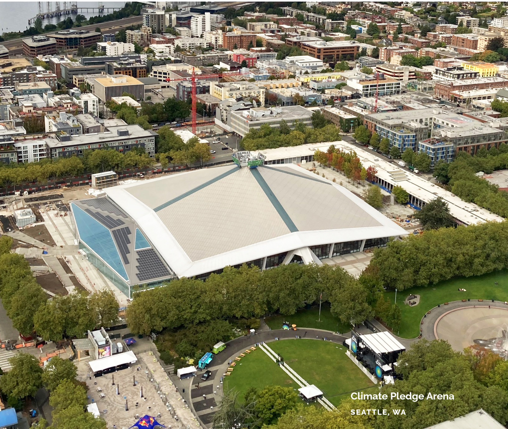
Climate Pledge Arena SEATTLE, WA

Learn how ESA's expert planners can benefit your next arena, stadium, hotel, or convention center project.