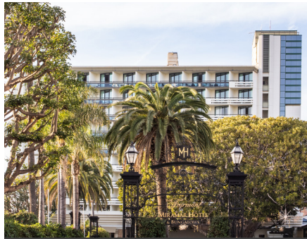
HOSPITALITY Miramar Hotel Redevelopment