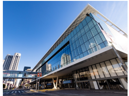
EVENT Moscone Center Expansion